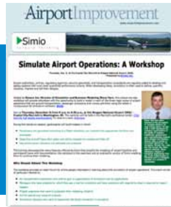
Custom E-Mail Blast